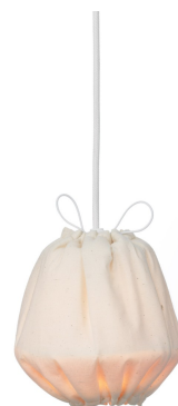
S, SHADE IN OFF-WHITE WITH RED DISC