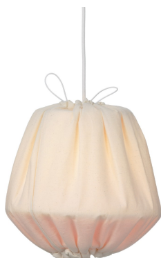
M, SHADE IN OFF-WHITE WITH RED DISC

The model was unveiled in 2011 as part of Claesson Koivisto Rune’s commission to design the highly renowned Nobis Hotel on Norrmalmstorg, Stockholm.